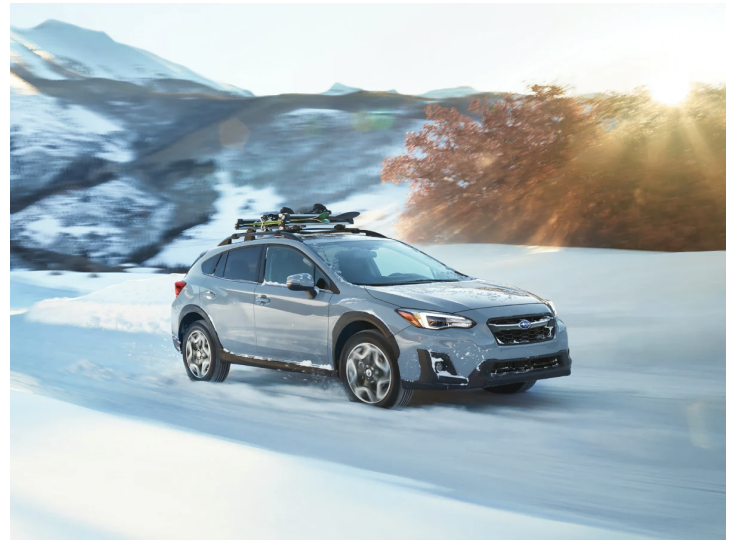
The Subaru Crosstrek is an example of a LEV.

The Rhode Island Low Emission Vehicle (LEV) program requires that new vehicles sold in the state meet the same emission requirements as new vehicles sold in California. The program includes model year 2008 and newer vehicles with a Gross Vehicle Weight Rating (GVWR) up to 6,000 pounds, and Model Year 2009 and later vehicles with a GVWR up to 14,000 pounds.