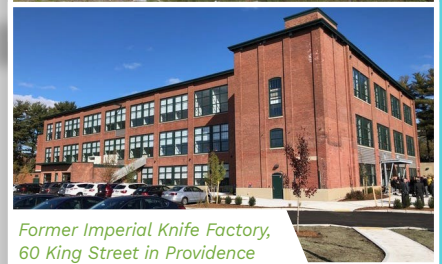
Former Imperial Knife Factory, 60 King Street in Providence