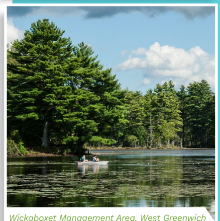
Wickaboxet Management Area, West Greenwich