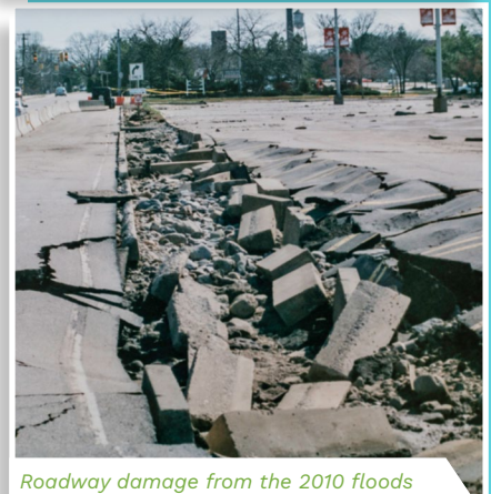
Roadway damage from the 2010 floods