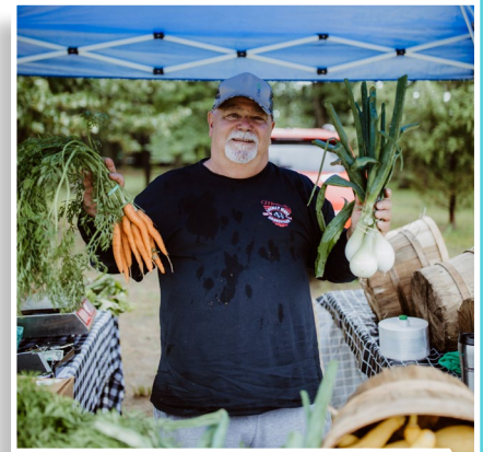
Goddard Memorial State Park Farmers Market

COASTAL RESILIENCE $2 MILLION for matching grants to public and non-profit entities to restore and/or improve the climate resilience of vulnerable coastal habitats and to restore river and stream floodplains. Projects would improve community resiliency and public safety in the face of increased flooding, major storm events, and environmental degradation.