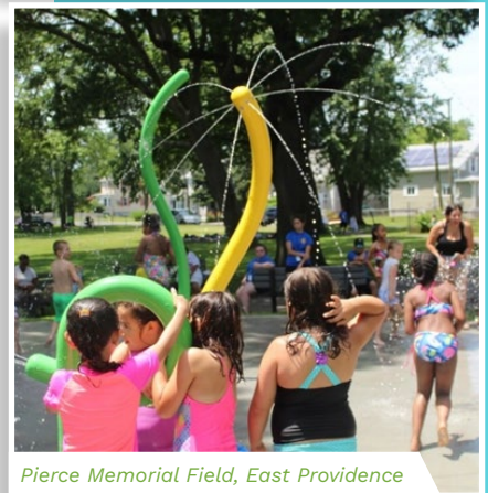
Pierce Memorial Field, East Providence