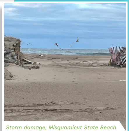
Storm damage, Misquamicut State Beach