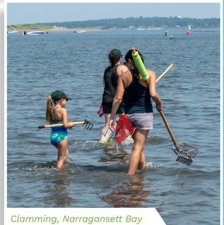
Clamming, Narragansett Bay