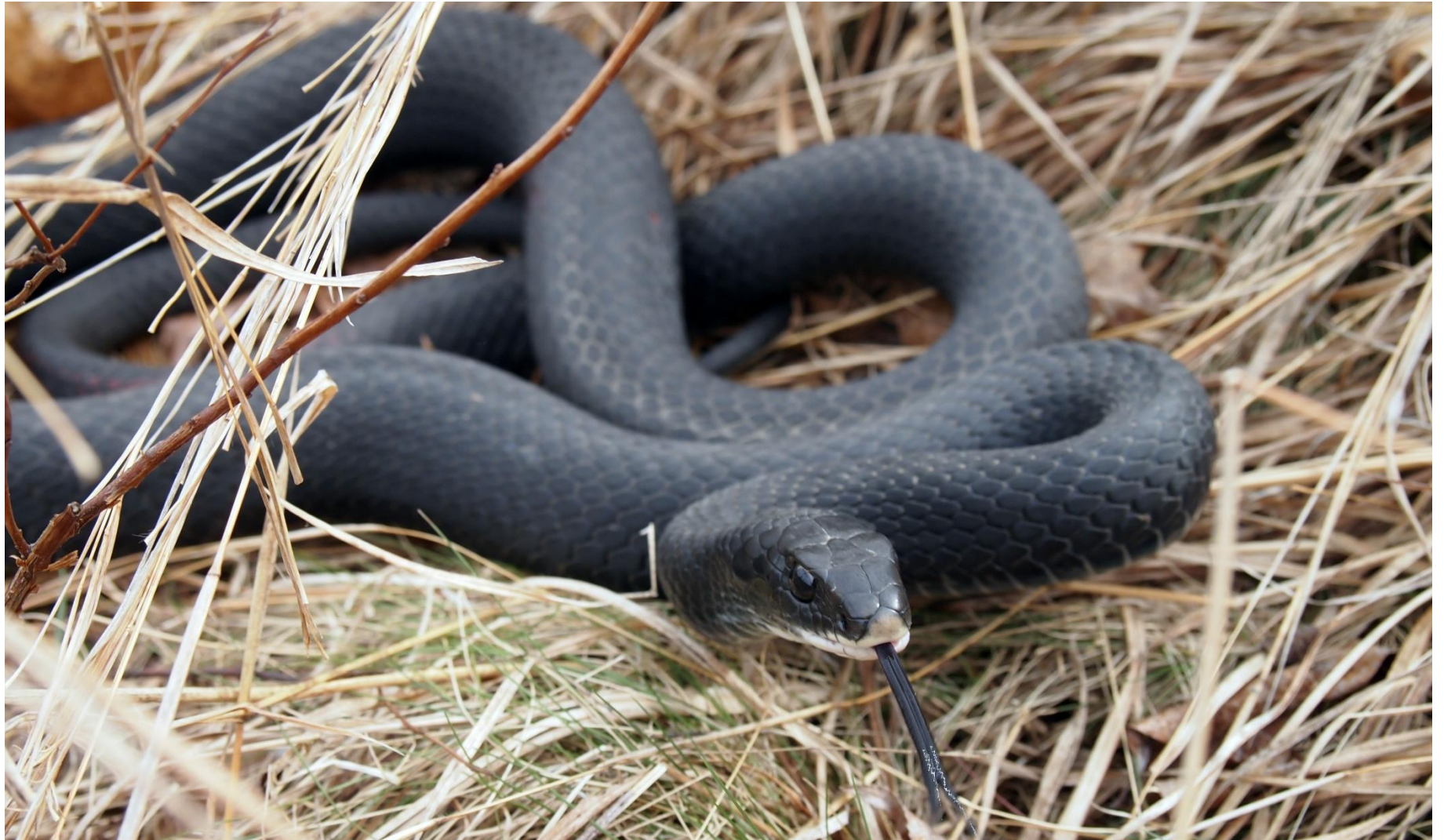
Black Racer, C. Raithel