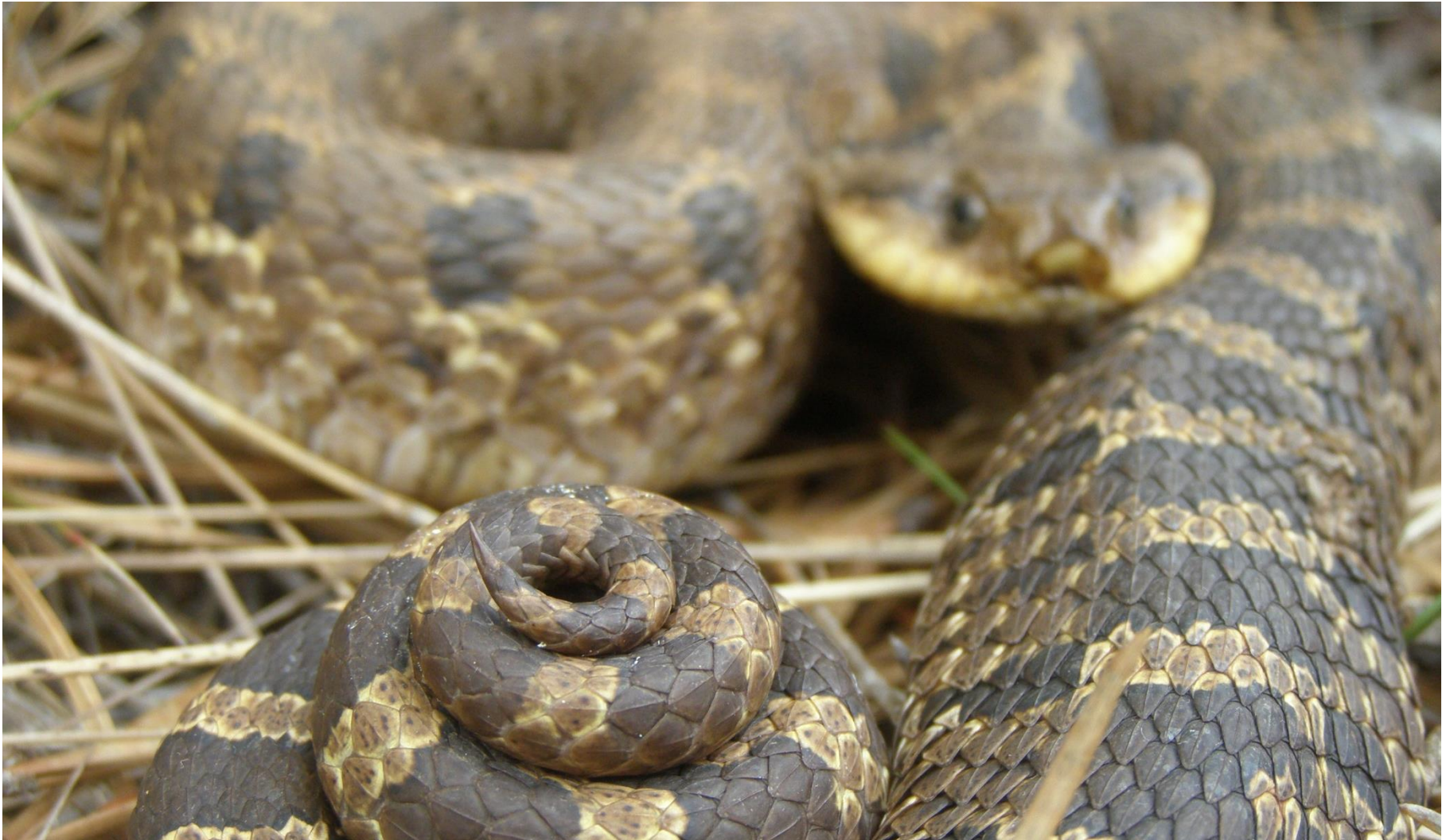
Eastern Hognose, S. Buchanan