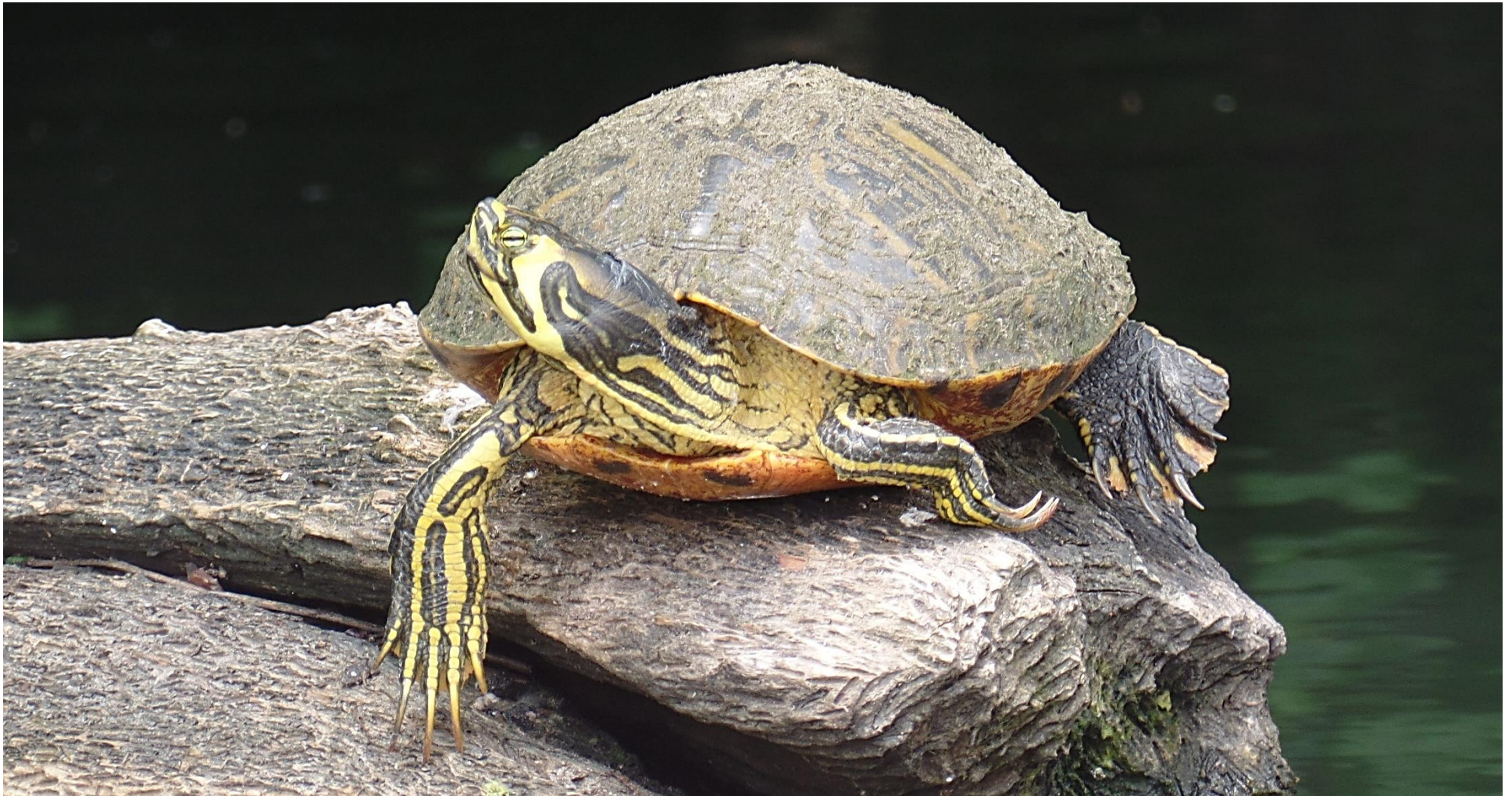
Yellow-bellied Slider, (non-native)