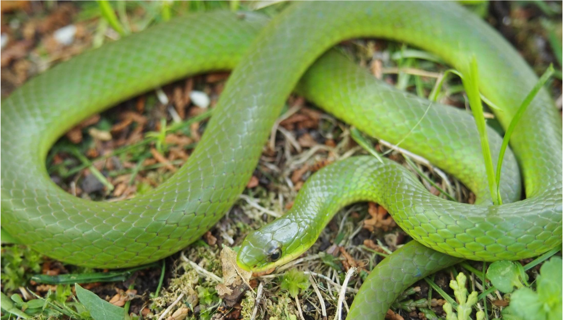
Smooth Greensnake, C. Raithe!