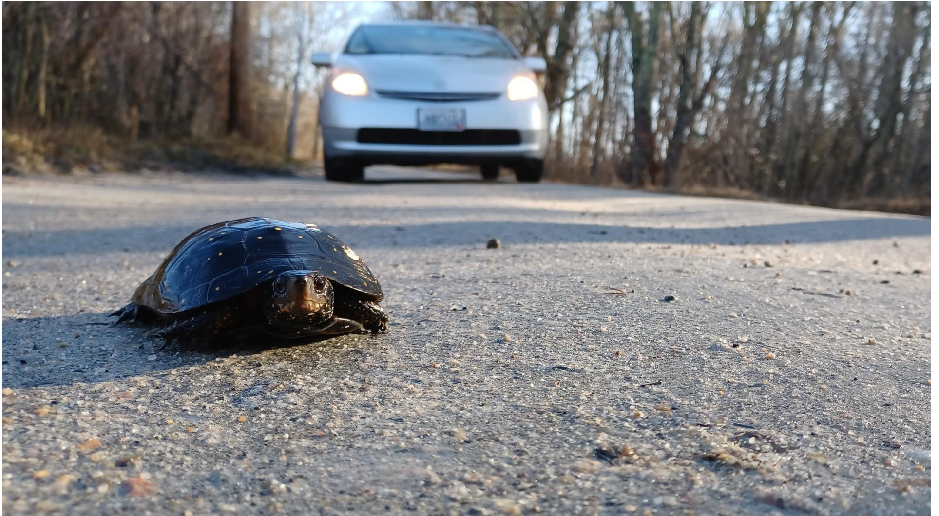
Spotted Turtle, G. De Meillon