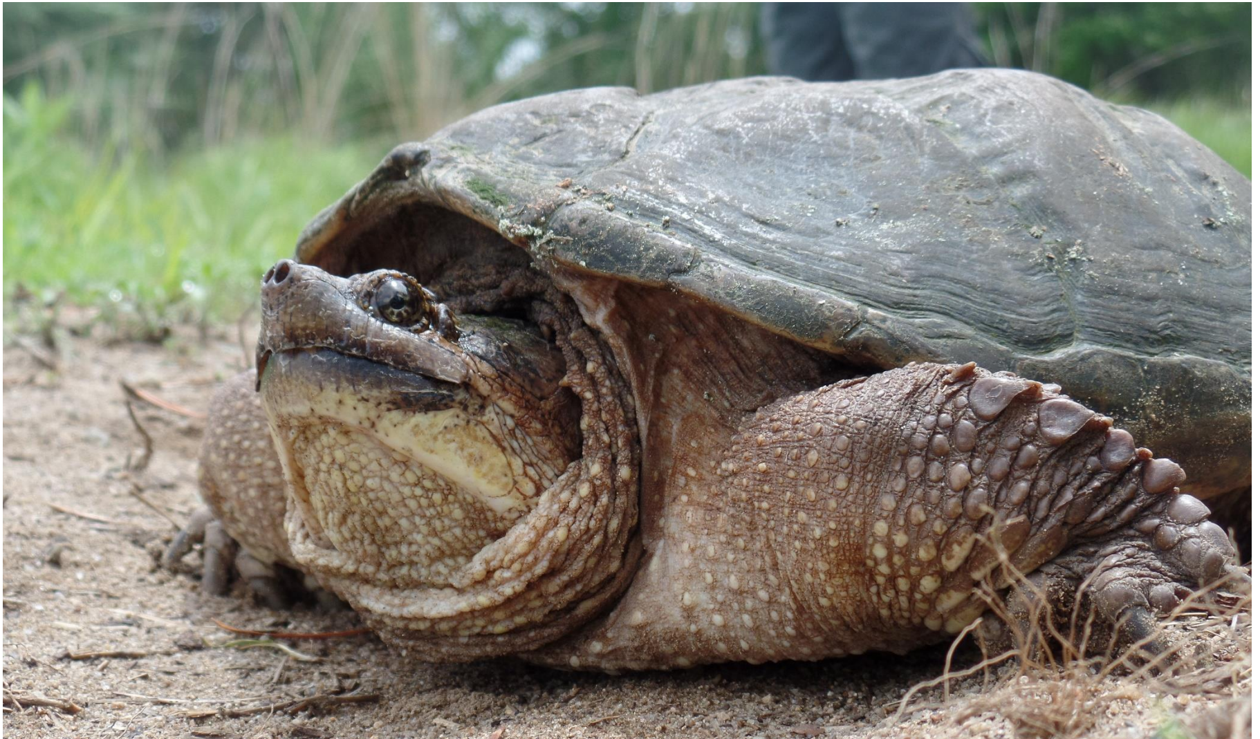
Common Snapping Turtle, G. De Meillon