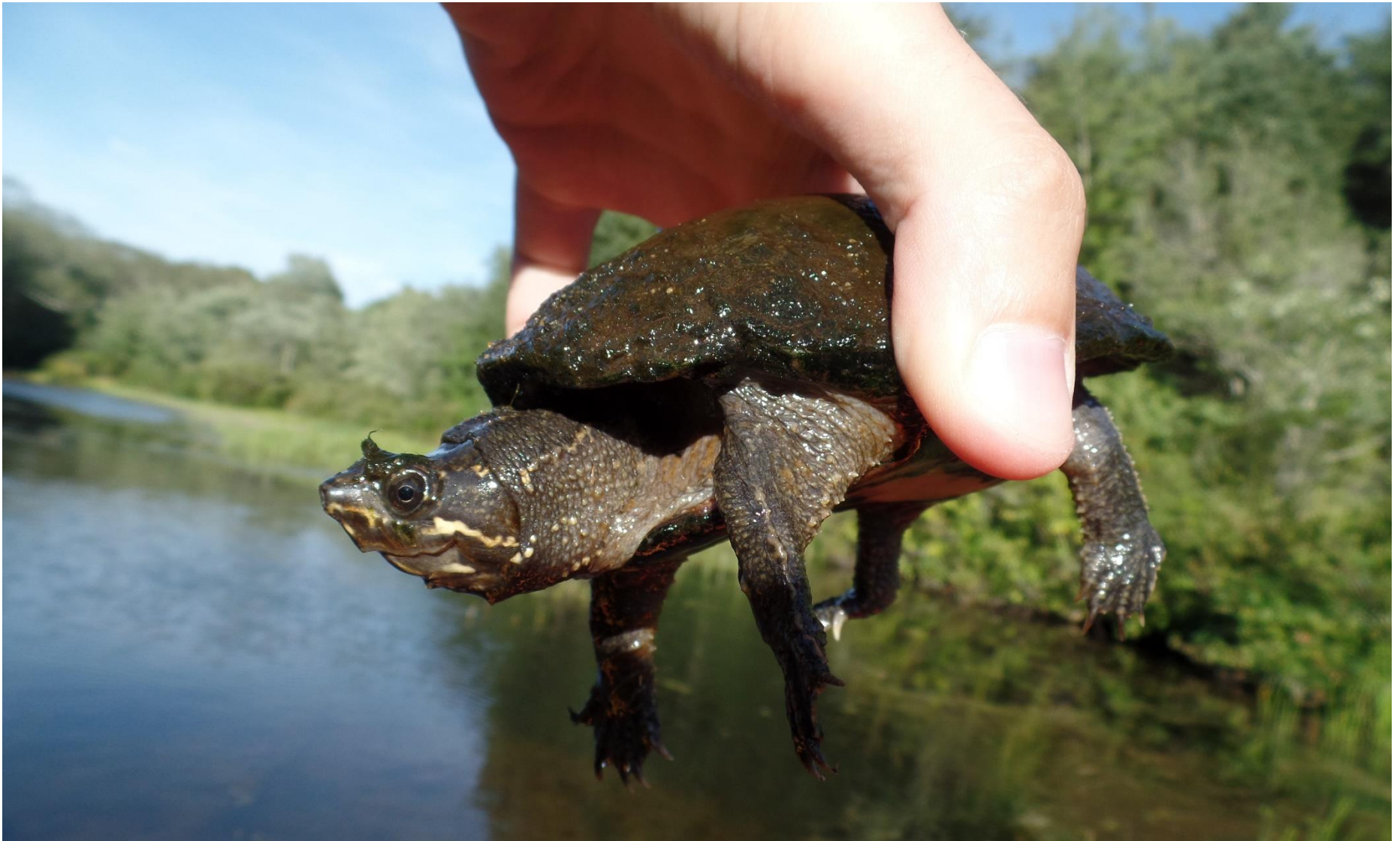
Musk Turtle