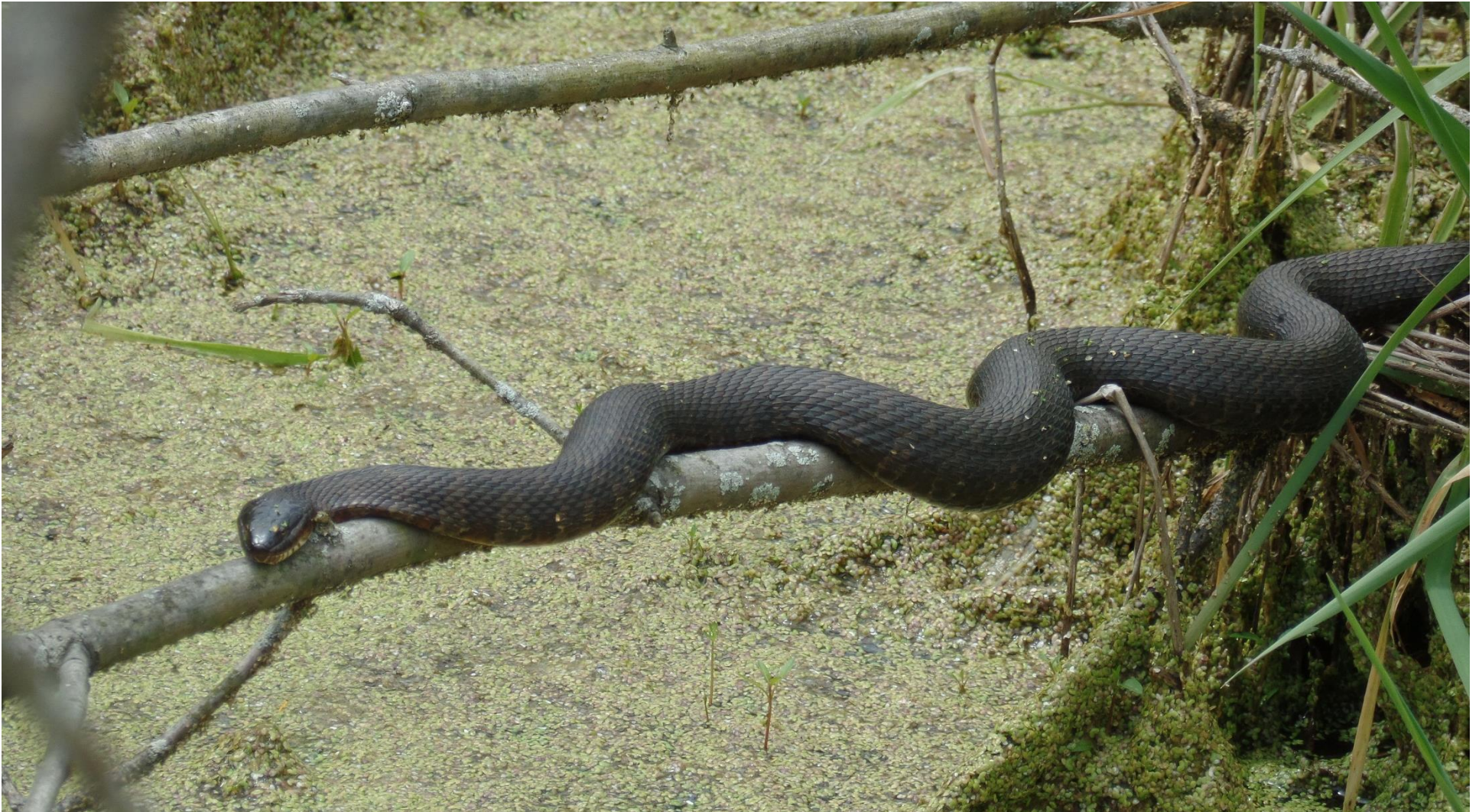
Northern Watersnake