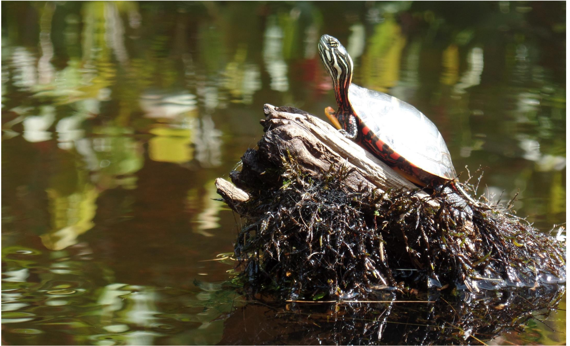
Eastern Painted Turtle, G. De Meillon