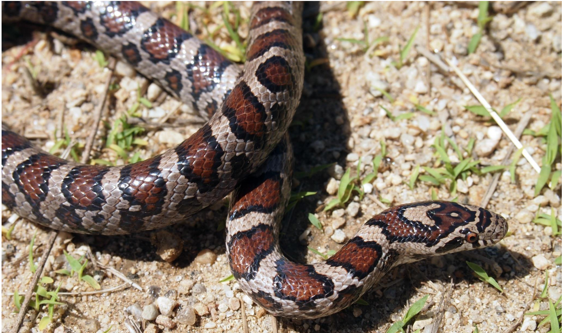
Eastern Milksnake, C. Raithel