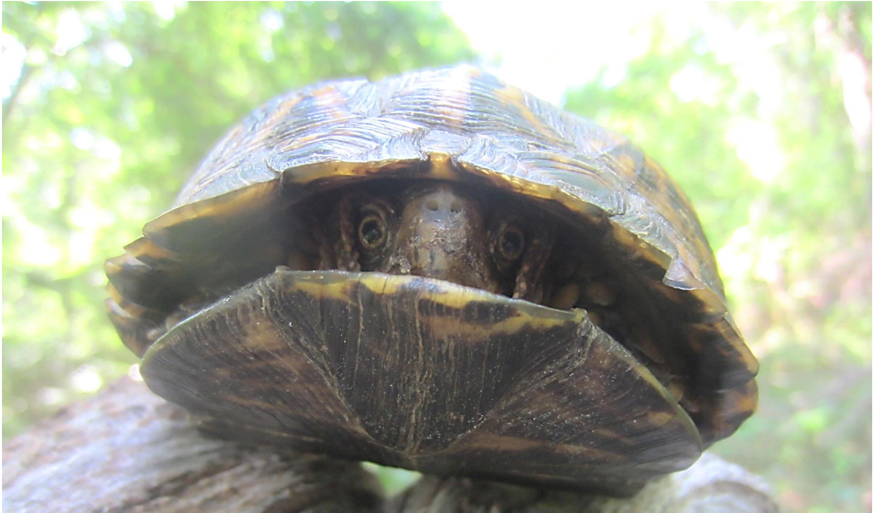
Eastern Box Turtle, G. De Meillon