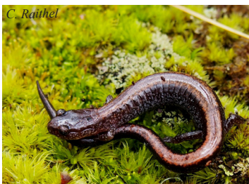
Eastern red-backed salamander ( Plethodon cinereus )

Salamanders and newts have very unique life-cycles. Some salamanders only lay eggs in vernal pools in late winter, some protect them under logs in the fall, some move from water to land and back to water once more. Salamanders are not lizards. They start their lives with gills, move onto land and have permeable skin, defining them as amphibians, not reptiles. With eight species of salamanders in Rhode Island, including the remarkable red-spotted newt, each has its own distinctive adaptations that help it to survive. Most salamanders share similar diets, eating insects and other small terrestrial invertebrates. Tadpoles typically feed on algae, however, marbled salamander tadpoles are known predators and will eat the eggs and larva of other amphibians.