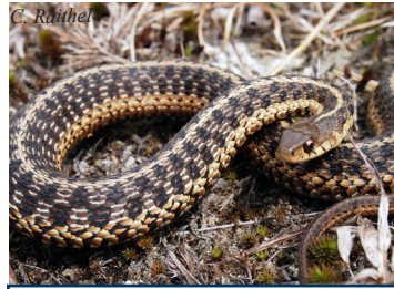
Eastern garter snake ( Thamnophis sirtalis sirtalis )