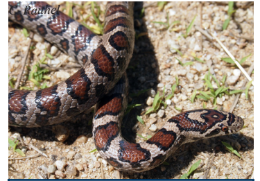
Eastern milk snake ( Lampropeltis triangulum triangulum )