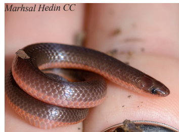
Eastern worm snake ( Carphophis amoenus amoenus )