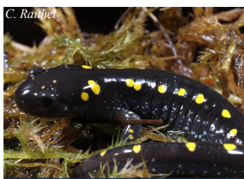
Spotted salamander ( Ambystoma maculatum )