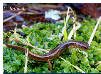
Northern two-lined salamander ( Eurycea bislineata )

For detailed information about each species, check out the Salamanders of Rhode Island fact sheet from RI Division of Fish and Wildlife.