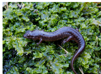
Northern dusky salamander ( Desmognathus fuscus )