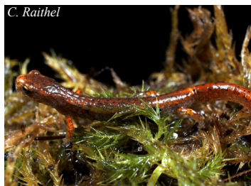
Four-toed salamander ( Hemidactylium scutatum )