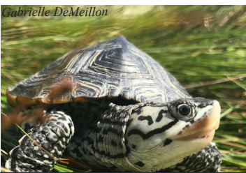
Northern diamond-backed terrapin ( Malaclemys terrapin terrapin )