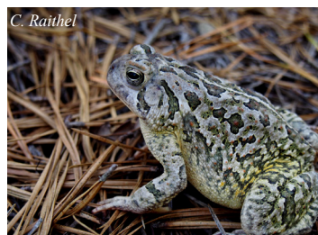
Fowler's toad ( Anaxyrus fowleri )