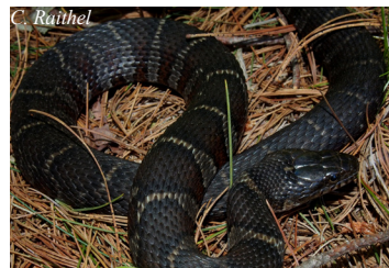
Northern water snake ( Nerodia sipedon sipedon )