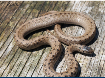
Dekay's brown snake ( Storeria dekayi dekayi )

Snakes are fascinating creatures but have long been misunderstood due to myth and misinformation. They are a natural and important part of healthy ecosystems and if left alone, pose no threat to humans. Fear comes from the unknown; by taking time to learn about Rhode Island's native snakes and their habits, this apprehension can be overcome.