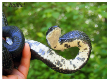
Eastern rat snake ( Pantherophis alleganiensis )