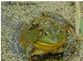
American bullfrog ( Lithobates catesbeianus )

While most people think frogs and toads are the same, they are actually quite different. Both are amphibians, spending part of their lives in the water, but most toads only return to the water as adults to lay eggs. Rhode Island has seven species of frogs and three species of toads. The most apparent difference between frogs and toads is the mucus covering on frogs that protects their smooth, permeable skin from drying out. Toads have bumpy skin that is more tolerant of dry conditions. Toads also have paratoid glands, which frogs lack, located on the back of their heads. These glands produce a toxic substance that deters predators from eating them. Though unique in their adaptations, both frogs and toads are greatly impacted by habitat loss and fragmentation caused by development.