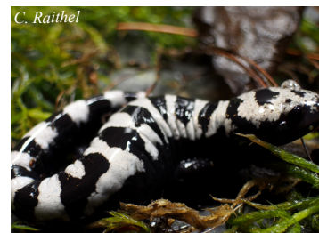
Marbled salamander ( Ambystoma opacum )