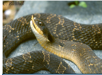
Eastern hognose snake ( Heterodon platirhinos )