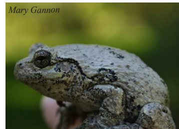
Gray tree frog ( Hyla versicolor )