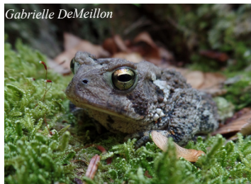
Eastern American toad ( Anaxyrus americana )