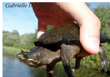
Eastern musk turtle ( Sternotherus odoratus )