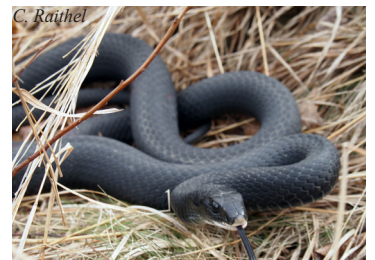
Northern black racer ( Coluber constrictor constrictor )