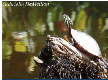
Eastern painted turtle ( Chrysemys picta picta )