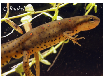
Eastern red-spotted newt ( Notophthalmus viridescens )