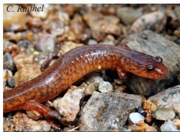
Northern spring salamander ( Gyrinophilus porphyriticus )