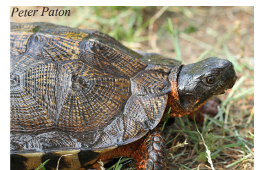
Wood turtle ( Glyptemys insculpta )

For detailed information about each species, check out the Turtles of Rhode Island fact sheet from RI Division of Fish and Wildlife.