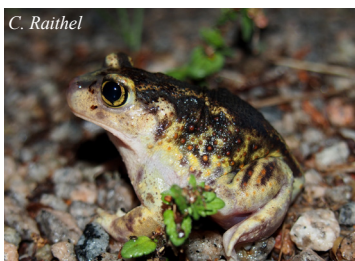
Eastern spadefoot toad ( Scaphiopus holbrookii )