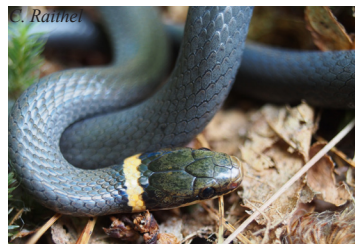
Northern ring-necked snake ( Diadophis punctatus edwardsii )