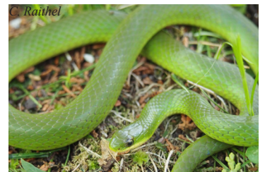
Smooth green snake ( Opheodrys vernalis )

For detailed information about each species, check out the Snakes of Rhode Island fact sheet from RI Division of Fish and Wildlife.