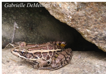
Pickerel frog ( Lithobates palustris )