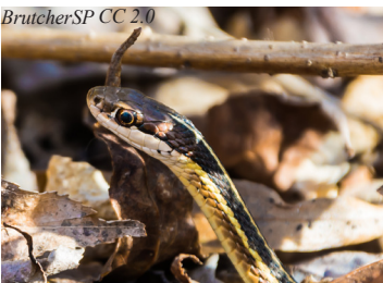
Eastern ribbon snake ( Thamnophis sauritus sauritus )