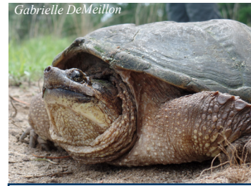
Common snapping turtle ( Chelydra serpentina )