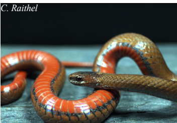
Northern red-bellied snake ( Storeria occipitomaculata occipitomaculata )