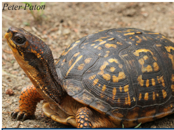
Eastern box turtle ( Terrapene carolina carolina )

Turtles are one of Rhode Island's most charismatic animals. They are typically well loved and appreciated, but their needs are not often well understood. Habitat loss, fragmentation and poaching threaten our native turtles. Seven species of turtles live in Rhode Island, some spend their lives in freshwater ponds and streams, while others live almost entirely on land. Four species of sea turtles visit our coasts, Kemp's ridley ( Lepidochelys kempii ), leatherback ( Dermochelys coriacea ), loggerhead ( Caretta caretta ) and green sea turtle ( Chelonia mydas ). All of the turtles that spend even a fraction of their lives in our state depend on us to protect their populations and their habitats.