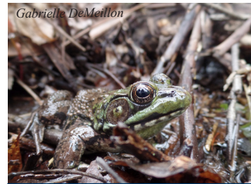
Green frog ( Lithobates clamitans )

For detailed information about each species, check out the Frog & Toads of Rhode Island fact sheet from RI Division of Fish and Wildlife.