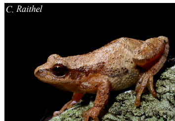
Spring peeper ( Pseudacris crucifer )