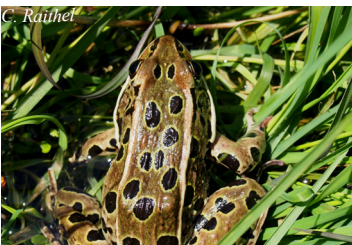
Northern leopard frog ( Lithobates pipiens )