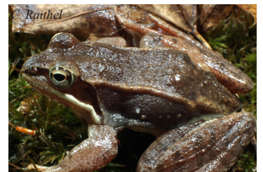
Wood frog ( Lithobates sylvaticus )