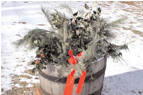
According to a DEM survey, one to five percent of forest landowners have commercially harvested an alternative forest product, including maple syrup, mushrooms, witch hazel, and floral greens.