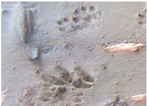
Forests in Rhode Island provide habitat to 86 species of mammals, 394 species of birds, 19 amphibians, and 26 species of reptiles.