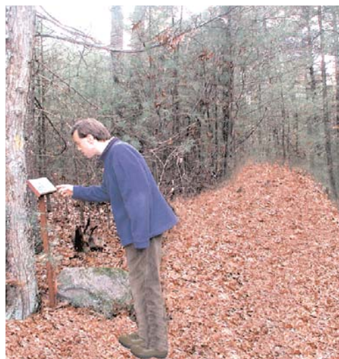
The Apeiron Institute has developed a trail system that includes a series of educational signs to inform visitors about the forest. The organization relies on donations from trail users to fund educational programs.

They have also developed a trail system through the forest that includes a series of educational signs to inform visitors about the forest. The organization relies on donations from trail users to fund educational programs and markets the trail to potential users through their website ( www.apeiron.org ) and email database.