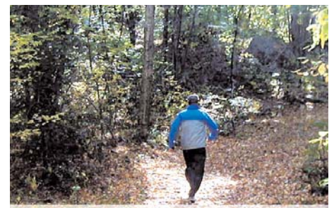
Many Rhode Islanders participate in forest-based recreation: 31 percent participate in nature watching, 17 percent in camping, 14 percent in hiking, five percent in equestrian trail use, four percent in off-road vehicle use, and three percent in hunting. 2