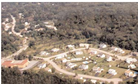
Of all sectors of development farm, forest, and open space produce the greatest financial incentive for municipalities. For every dollar of revenue generated by undeveloped land towns spend an average of 42 cents on public services, leaving 58 cents to offset other municipal expenses.

Rhode Island's forests provide many benefits including clean air and water, habitat for wildlife, aesthetic values, places for recreation, as well as economic opportunities. Considering that they enhance the quality of life in Rhode Island, it is in everyone's best interest to insure the protection and wise management of the state's forest resources.