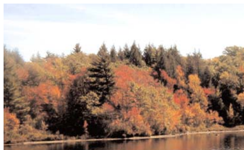
75 percent of Rhode Island residents depend on surface water reservoirs for drinking water. Forests play an important role in maintaining water quality and quantity. Protecting forests in water supply basins is a strategy used to ensure safe and plentiful drinking water supplies.

This publication is part of an effort by DEM, which included publications, workshops, and challenge grants, to increase landowner awareness about forest management opportunities that prevent fragmentation of forest land by providing a way to pay property expenses so the land does not have to be sold for development.