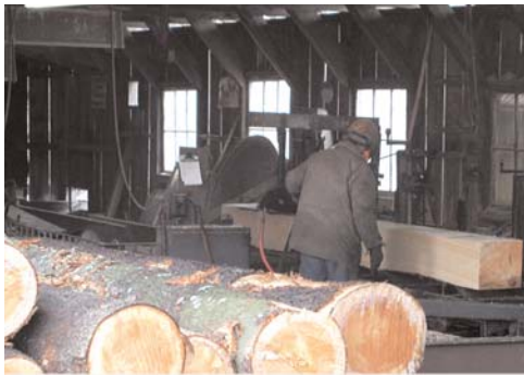
The forest products industry in Rhode Island represents 3.3 percent of manufacturing jobs with an annual payroll income of 22 million dollars. 3