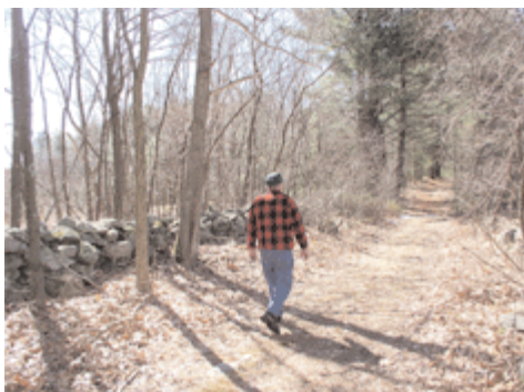
A system of trails provide access through the property for recreation and forest management.

The family has planted a variety of conifers for Christmas trees, has tapped maple trees for syrup, and have harvested woodland plants for use as floral greens during the holiday season. He is currently investigating the feasibility of harvesting witch-hazel on the property, as well as opportunities for growing medicinal plants.