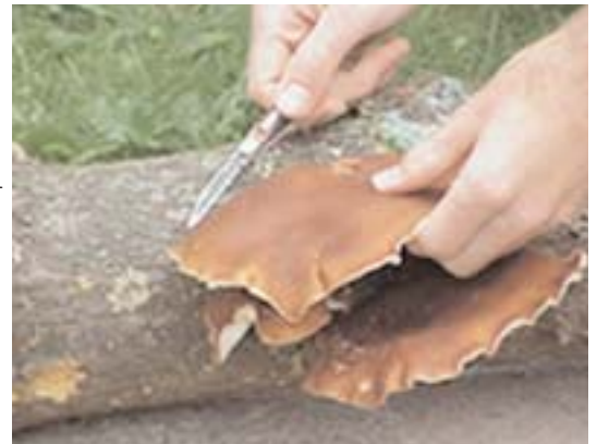
The Southside Community Land Trust received a grant from DEM to inoculate 200 logs with shiitake and oyster spawn to grow mushrooms and provide another locally grown product to be sold at the Broad Street Farmers market.

Southside Community Land Trust recently began growing shiitake and oyster mushrooms to diversify the crops grown at the farm and to satisfy the demand for